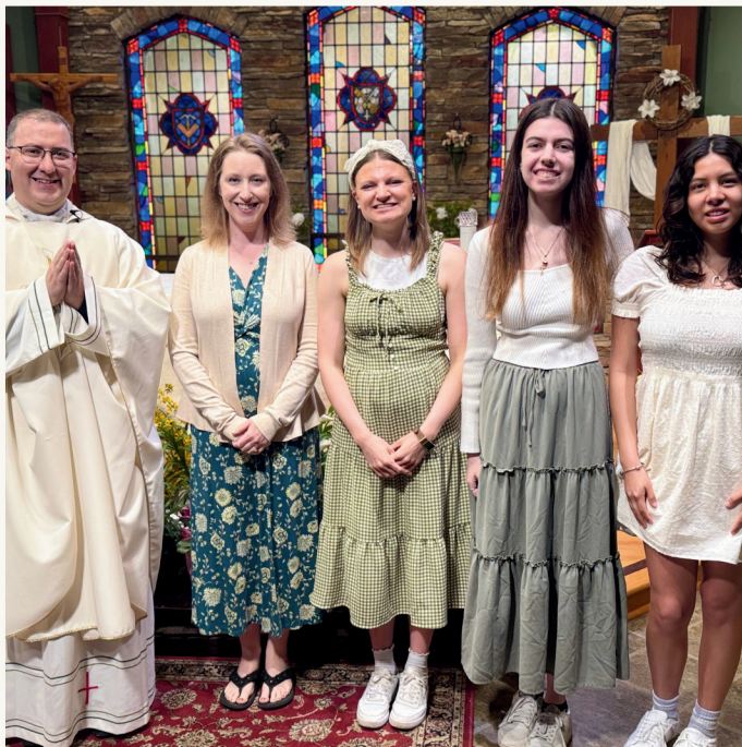
Celebrating Mass at the Office of Radio & TV