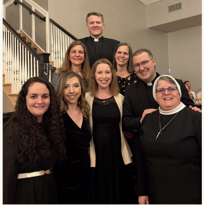
St. Francis Staff attend the Light of Faith banquet for the Apostles of the Sacred Heart